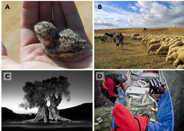
Fig. 2. Examples of relational values. (A) A young water bird ( Charadrius sp.) in a human hand illustrates stewardship of nature. In the parlance of relational values, regardless of a thing's current state, what matters most is humans' responsibilities, which stem from our relationships with that thing. (B) Transhumant shepherds and sheep dogs on their annual migration on the Iberian Peninsula. The relationship goes beyond management for human benefit, reinforcing cultural identity through active ritual care. (C) Ancient olive tree on Aigina Island, Greece, 1,500–2,000 years old. The tree is no longer harvested but has great symbolic significance for island people. (D) Salmon fishing on the west coast of North America is particularly rich in relational values due to benefits and values such as sustenance, identity, and strengthening of social ties.

into the instrumental framing of ecosystem services because they are inherently relational: cultural services are valued in the context of desired and actual relationships (Fig. 1).